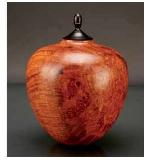
Redwood Burial Urn, 2010, Redwood, 10" × 10" (25cm × 25cm)

which they sold in 2010 to buy a farm in California just east of Sacramento—and another house to restore.