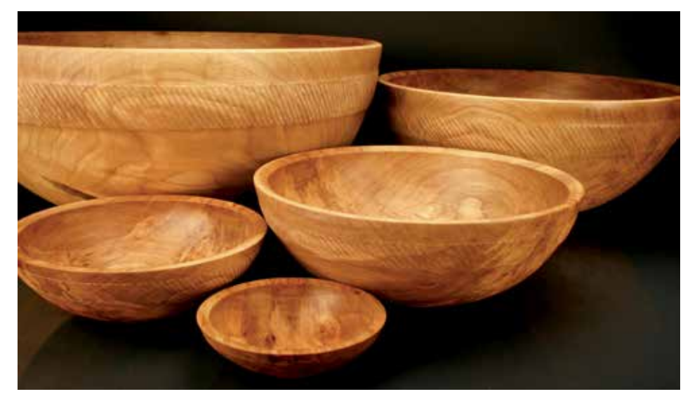
Silver Maple Pioneer Nested Set, 1994, Silver maple, largest: 9" × 24" (23cm × 61cm)

Most spindle orders were declined until, in 2003, Mike was offered a contract making high-end lamp