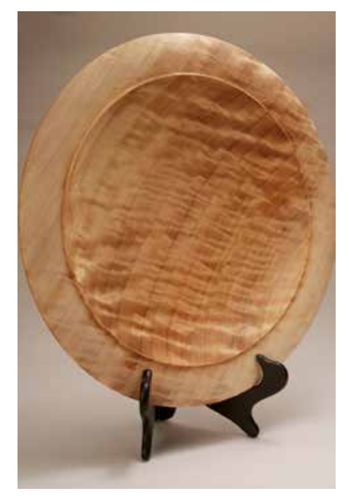
Mormon Poplar Platter , 2008, Mormon poplar, 2" × 24" (5cm × 61cm)

against splitting. As Mike breaks down logs to liftable lumps, he takes particular care to eliminate all defects. Mike doesn't embellish his bowls, preferring simple classic utilitarian forms, but he does cut for interesting grain patterns, preferably with impressive figure.