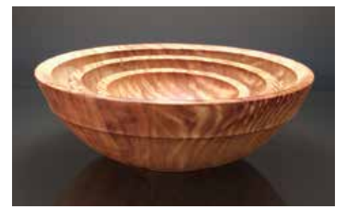
Mormon Poplar Nested Set , 2007, Mormon poplar, largest: 5" × 14" (13cm × 36cm)