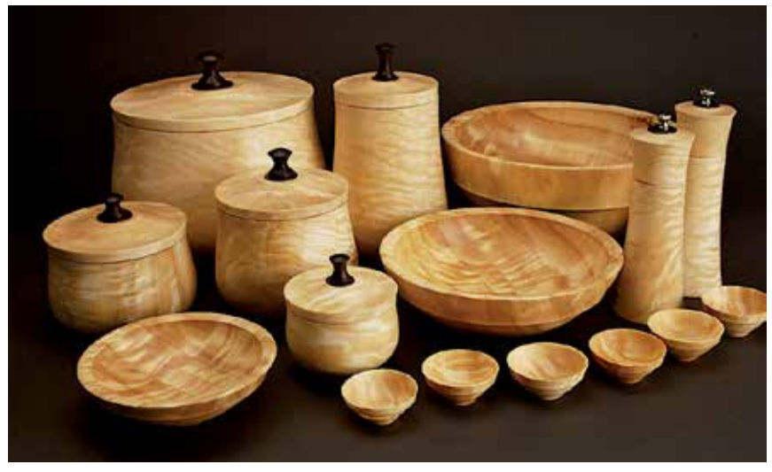
Kitchen Set, 2001, Mormon poplar