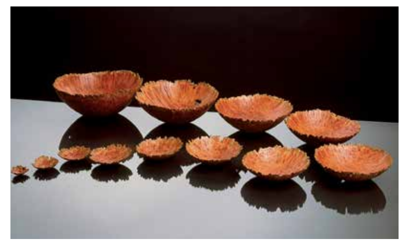
Jarrah Burl Nested Set, 2004, Jarrah burl, largest: 7" × 11" (18cm × 28cm)

clubs, only to major symposia and to Craft Supplies for his annual handson workshop.